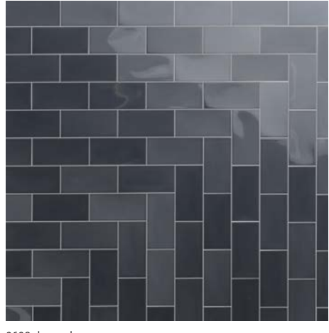
0608 charcoal grey