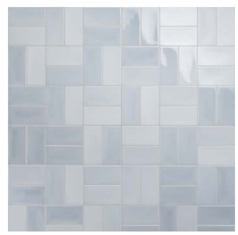
0604 blue mist