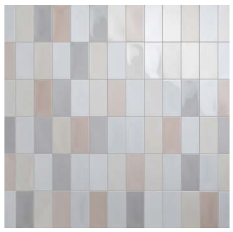
Mix 0601 serene white / 0602 blush / 0605 fog grey / 0606 bone