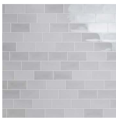
0605 fog gre